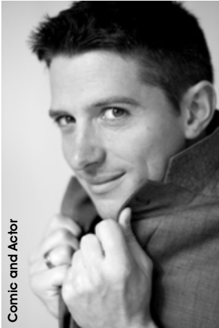
Comic and Actor

"Charming, expert stand-up" Sunday Times